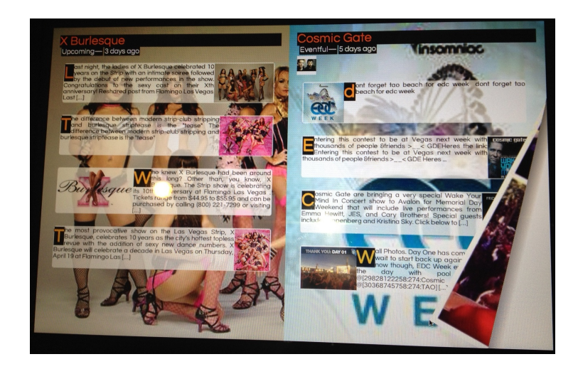
Fig. 2. Screenshot of the NiteOutMag application with two events from Las Vegas and the righthand-side page about to be flipped

whereas Hong Kong is known to have bad coverage. Further, we asked them to evaluate the application with a city of choice. Our evaluation criteria were speed at which a magazine for a given city was generated, usefulness of the selected events, relevancy of the selected images for these events, and attractiveness of the events and media. Further, we allowed for optional free-form answers to the following questions: "How could NiteOutMag be improved?", "How many pages did you count in NiteOutMag?", and "How many event sources did you count in NiteOutMag?". The last two questions enable us to check whether the application worked as expected.